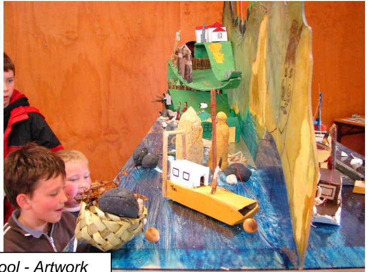
Karitane School - Artwork